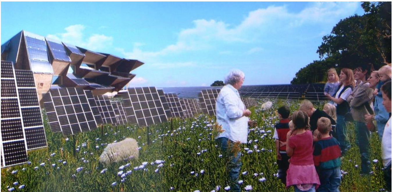
Artist's impression of the proposed Wally Corner solar farm and associated visitor centre (Now with planning consent)