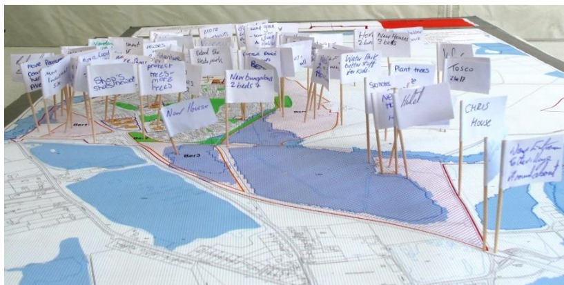
Public consultation at fête

This deliberate involvement was identified as a recommendation in the 2009 Parish Plan and has been carried forward by the Berinsfield Advisory Group. The Berinsfield Information and Volunteer Centre (BIVIC) agreed to coordinate this communication activity. Berinsfield Advisory Group (BAG) has taken recommendations from the Parish Plan 2009 as the basis for its Community-led Plan 2013 and has developed these further.