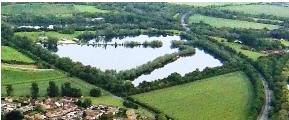
Queenford Lakes Watersports Centre has a deserved reputation as a centre of excellence

Some consultees have commented that Queenford Lakes Water Sports Centre (BER24) currently has a non-statutory designation as a Local Wildlife Site (LWS) due to its earlier interest for over-wintering birds. This is misleading as this former minerals site was designated by Oxford County Council in 1966 for recreational purposes and is used extensively year round for jet skiing, water skiing, fishing and open water swimming. Its planning history goes back over fifty years during which a public inquiry in 1995 removed all restrictions for recreational use from the original planning consent.